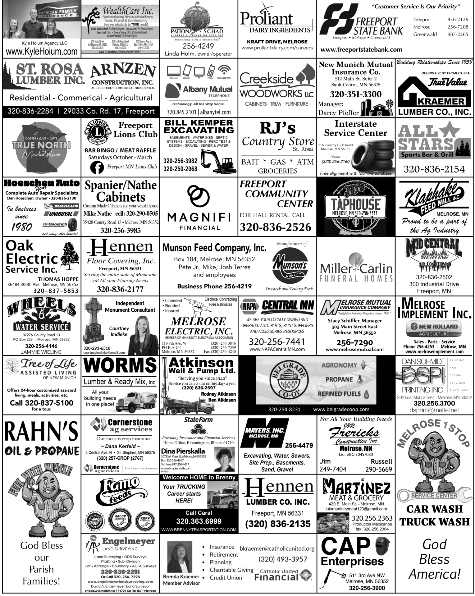
Please patronize these advertisers, their sponsorship makes our bulletin possible.